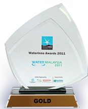
Winner of Two International Awards