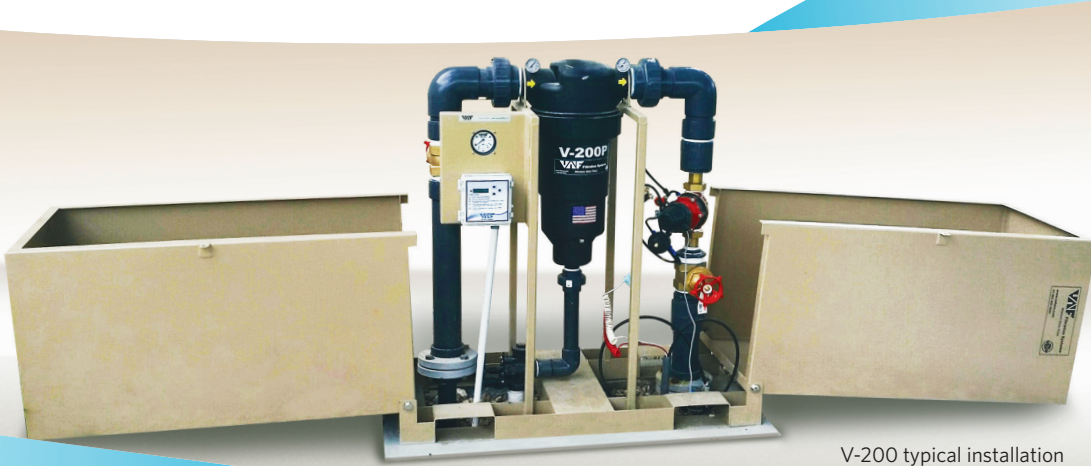
V-200 typical installation with enclosure