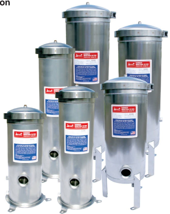
Models BC4-1, BC4-2, BC4-3, BC6-1, BC6-2, BC6-3

316 stainless steel Sanitary, BSTP or victaulic connections