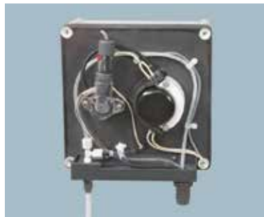
Sample Flow System