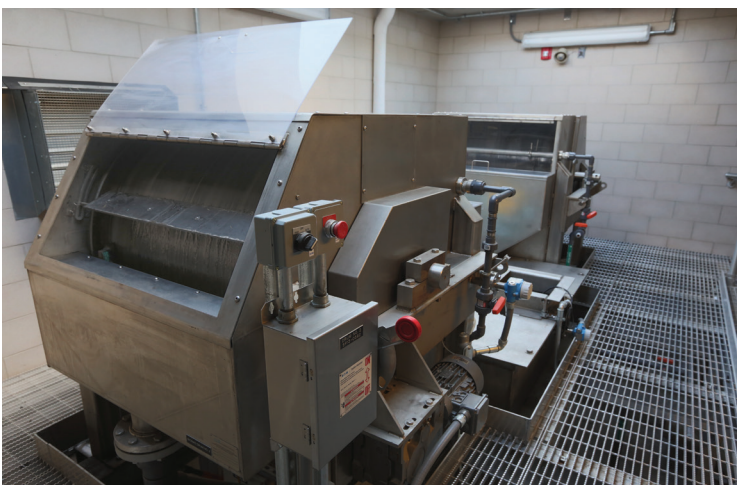
MAGNETITE RECOVERY DRUM