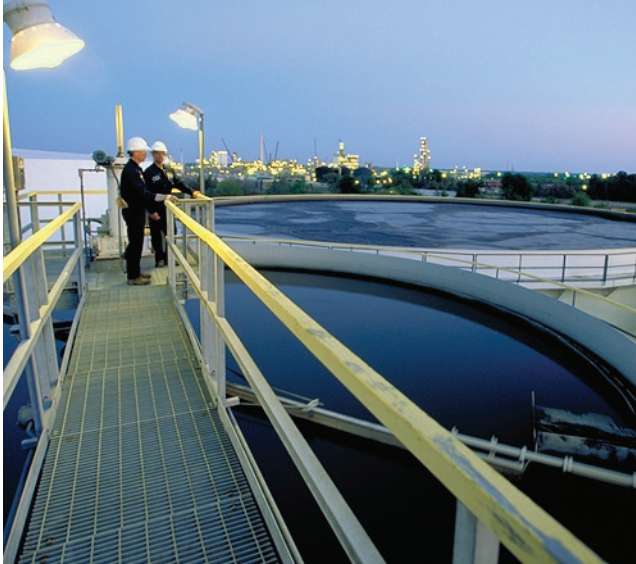
Onsite inspection services available from Evoqua trained and experienced technicians.