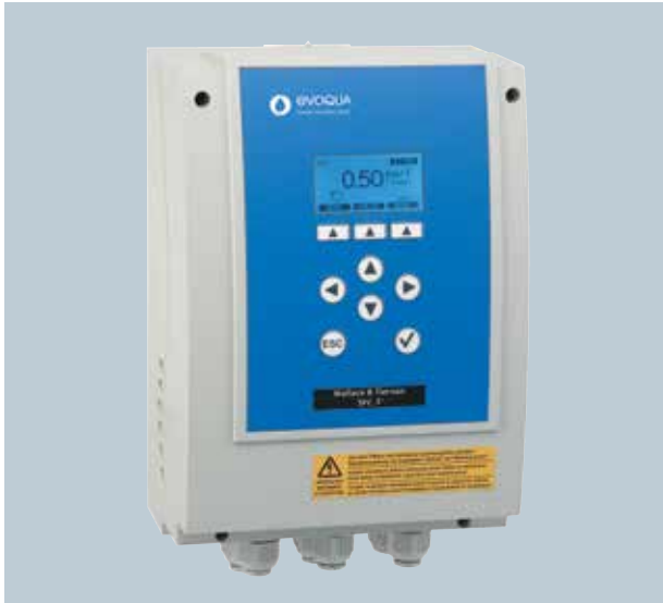
SFC MEASUREMENT AND CONTROL SYSTEM