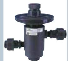
vacuum safety valve

FLEXIBLE CONFIGURATIONS: THE V10K™ GAS FEED SYSTEM IS AVAILABLE IN DIFFERENT DESIGNS