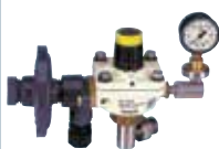
10 kg/h vacuum control valve