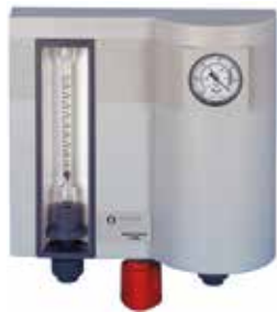
V10k manual system