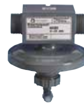
safety vent valve