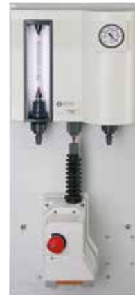
V10k automatic system