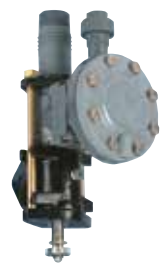
2" injector up to 15 kg/h Cl 2