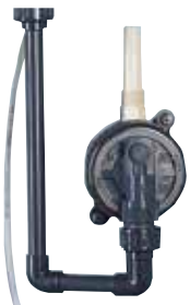
3/4" injector up to 4 kg/h Cl 2