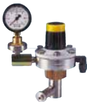
4 kg/h vacuum control valve