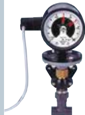
vacuum contact pressure gauge