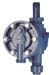
1" injector up to 10 kg/h Cl 2