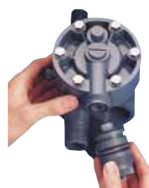
1" injector up to 10 kg/h Cl 2 anti-syphon