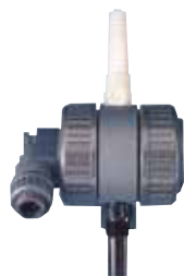
3/4" injector up to 4 kg/h Cl 2 anti-syphon