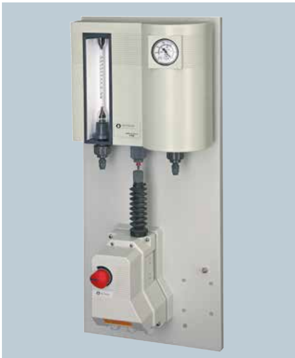
PRE-ASSEMBLED INSTALLATION OF THE V10K AUTOMATIC SYSTEM

With the V10k™ system the following control modes are available: