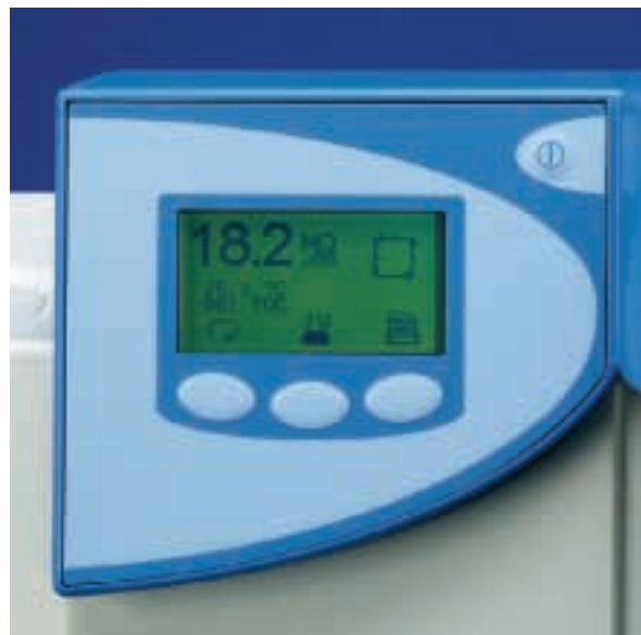
Figure 4 ELGA PURELAB Ultra display showing TOC reading.

ELGA launched the first TOC monitor to be built in to a laboratory water purifier in 1994. Other suppliers have followed later with different designs.